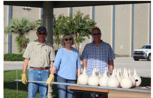
PUMA team with gourds they had just taken down.

We look forward to the return of the PUMAs next January or February.