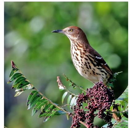
Brown Thrasher