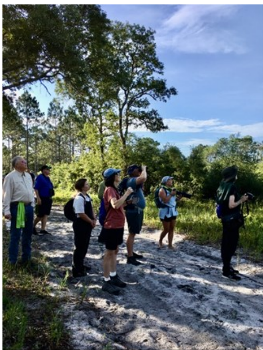
Rock Springs Run BioBlitz