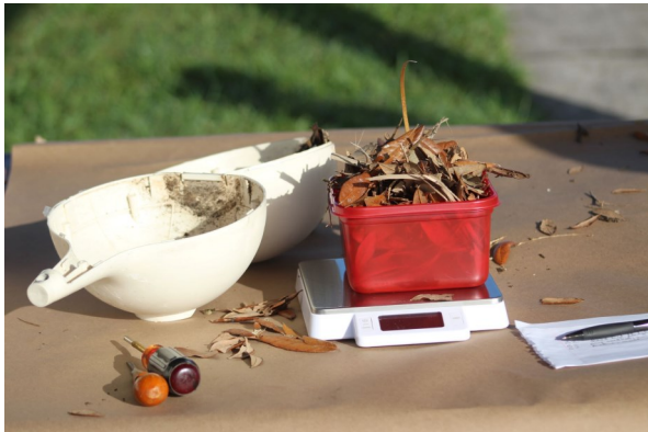
One of the lighter nesting gourds being weighed.

Pictured is a PUMA pair that was spotted on a streetlight at the marina in early February. The male appeared to be evaluating a small cavity on the light as a potential nesting site. It was the only observation at the light during the season, so they most likely moved to the SAS habitat as more PUMAs arrived.