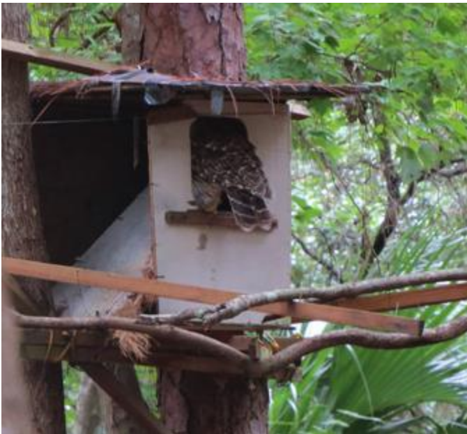
Photo three shows the owls obviously approved of the renovations ----TWINS!!!