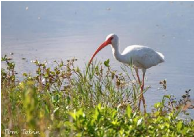
Photo: White Ibis