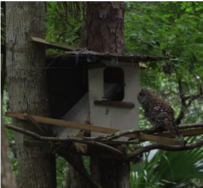
In photo two, owl parent takes a closer look at what remains of home. Jimmy Jones then repaired the box.

We decided that we needed to keep an eye out, just in case the snake came back, each of us taking turns walking by that window during the day. Lo